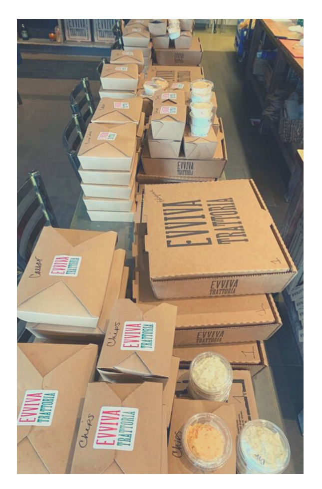
The delicious meals that Evviva Trattoria prepared for Lowell General Hospital staff, sponsored by the Auxiliary