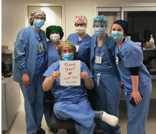
Members of Lowell General Hospital's hardworking frontline staff who were the recipients of the generosity of the Auxiliary. The Auxiliary is so pleased to support the dedicated clinicians and caregivers as they continue to fight the pandemic and keep our community safe and healthy.